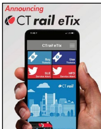
New CTrail eTix mobile App

Passengers are still able to purchase tickets at Ticket Vending Machines (TVM) at Hartford Line stations. Due to the current pandemic, onboard train ticket purchases with cash has been suspended. The new app serves all Hartford Line trains, Shore Line East trains and connecting travel onto New Haven Line trains operated by Metro-North. Daily parking for Berlin and Wallingford stations can be purchased on the app as well.