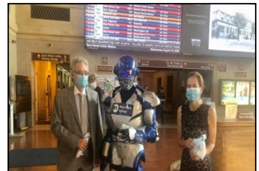
CT Lieutenant Governor Susan Bysiewicz hands out free masks with Commissioner Giuletti