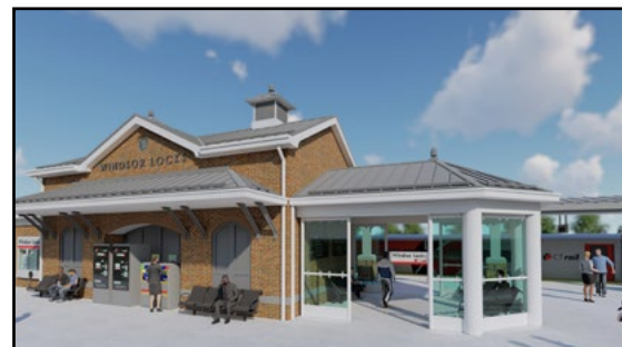
Rendering of new Windsor Locks Station

The new station will be approximately a mile north of the existing station and will comply with the Americans with Disabilities Act. Additional plans for the station call for a multi-use trail connecting the station to the Canal State Park Trail as well as track and signal work, a dedicated pedestrian bridge over the canal and digital signage for arrival and departure times.