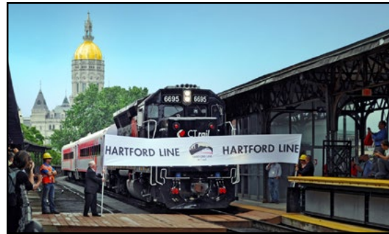
The New Haven-Hartford-Springfield Rail Line Launch

On June 16, the Hartford Line celebrated its second anniversary. The service, running from New Haven to Hartford and Springfield, has carried more than 1.2 million passengers since its launch in 2018.